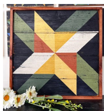
September 4 Mini Barn Quilt

Unleash your creativity! Whether you're a seasoned crafter or just looking to try something new, this is the perfect opportunity to relax, socialize and make something beautiful. All supplies are provided. To help offset the cost of supplies, please consider a donation of $3 per craft. Come enjoy a morning of fun and creativity at the library—bring a friend or make new ones!