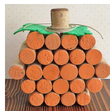
October 2 Wine Cork Pumpkins