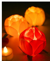
Flower Tealight September 19