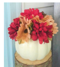
November 6 Floral Centerpiece