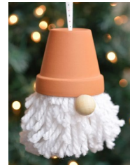
Gnome Ornament November 21