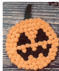
Pom-pom Pumpkin Coaster October 10